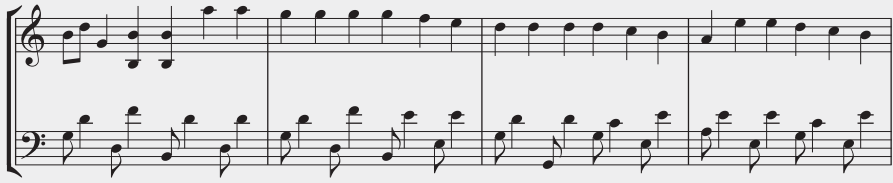
Example 2: A typical Mbira tune (“Nyamaropa,” performed by Samuel Mujuru in August 1996; transcribed by the author).

ward cascading of a typical mbira song (Example 2). As in the music of Ligeti’s sketch, mbira music tends to issue forty-eight-pulse interlocking lines, staggered in time, that inhabit the same approximate register – a mechanism that maximizes the emergence of inherent melodic rhythms (about which more below). Ligeti explains: “On the piano there is no possibility of the two hands playing the same pitches as they can on the mbira , because the piano was constructed having the bass on the left and the treble on the right. I have no symmetrical possibility, but I want to combine two patterns [...].” 2